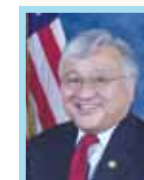
Congressman Mike Honda

Co-sponsored by Islamic Networks Group, the Community Relations Council of the Jewish Federation of Silicon Valley, Asian Americans for Community Involvement (AACI), League of Women Voters – Southwest Santa Clara Valley and San Jose-Santa Clara branches, Commonwealth Club Silicon Valley. This program will be recorded for broadcast on KLIV Radio later in April.